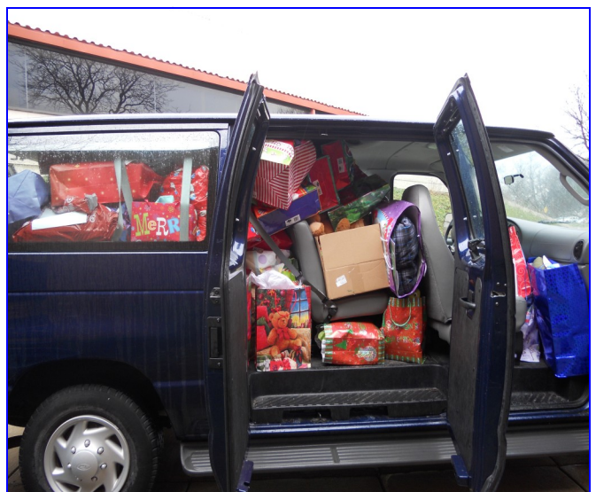
Below: UM-D staff and faculty donated over $10,000 worth of gifts for foster youth in the Wayne County area.